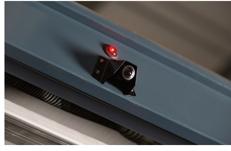
Back-up Camera and Sensors