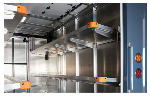
Fixed & Fold-up Shelves with Corner Pads

Utilimaster can help design the perfect R2 upfit to meet the specific needs of parcel delivery, linen & laundry, utility service, food & beverage, and contractors. From shelving and cabinets, to bins and partitions, to safety packages and exterior compartments, we offer a wide range of high quality upfit components to help make your job easier.