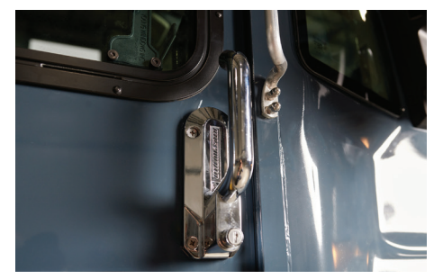
Heavy-Duty Ergonomic Door Handle