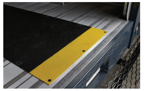
Sure-Foot Center Aisle

Utilimaster can help design the perfect R2 upfit to meet the specific needs of parcel delivery, linen & laundry, utility service, food & beverage, and contractors. From shelving and cabinets, to bins and partitions, to safety packages and exterior compartments, we offer a wide range of high quality upfit components to help make your job easier.