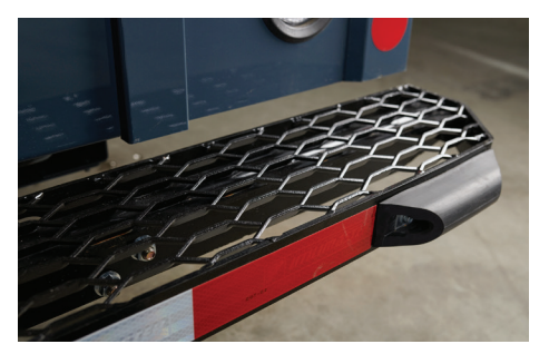
Grip Strut Bumper