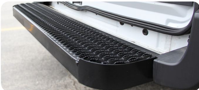
Grip Strut Shock-Absorbing Bumpers