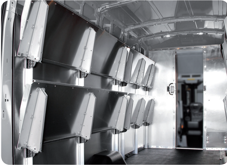
Versatile Shelves with Durable Sidewall Panels