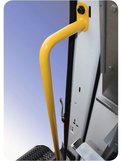
Rear Grab Handles