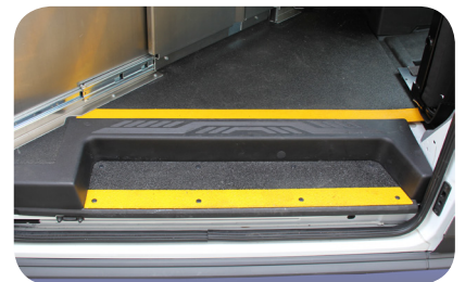
Side Door Scuff Plates