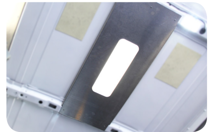
Motion Sensitive LED Cargo Lights