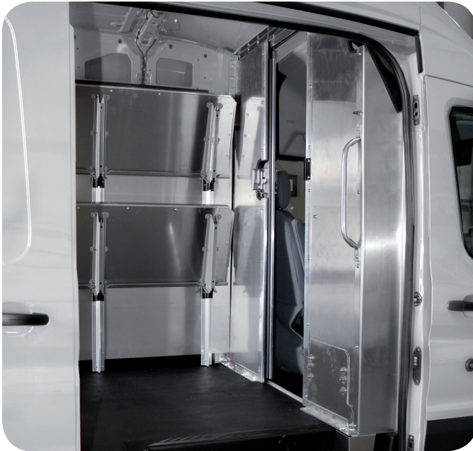
Bulkhead with Full-Height Sliding Door