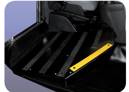
Non-slip Cab Floor Overlay