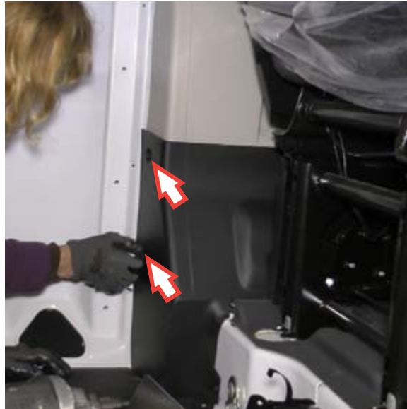
Lower B-pillar trim fasteners