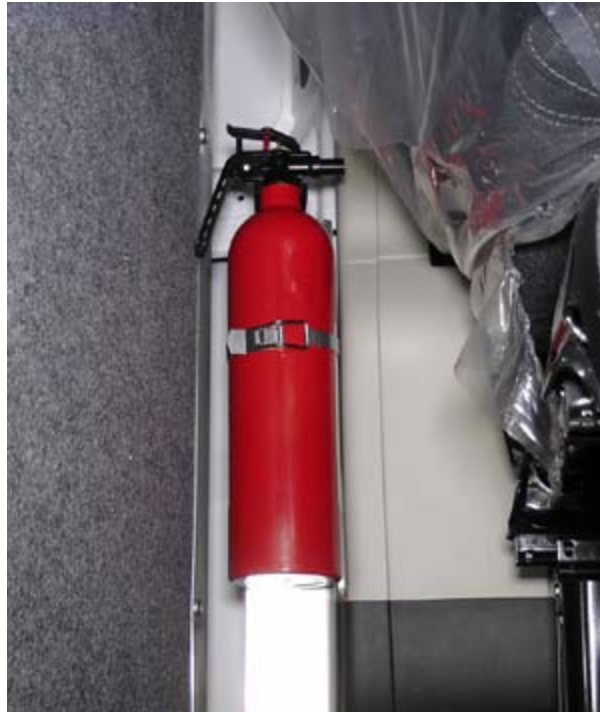
Fire extinguisher kit

This manual contains drawings and photos to aid in servicing the vehicle. It may include maintenance information on some items provided but not manufactured by Utilimaster Corporation. Items such as drivetrain components and certain interior furnishings may be covered by separate manufacturer-supplied information. Information provided here is intended to assist Utilimaster customers and is in no way meant to replace or supersede instructions provided by other suppliers for their products.