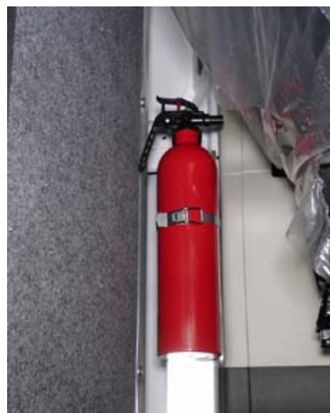
Fire extinguisher in bracket