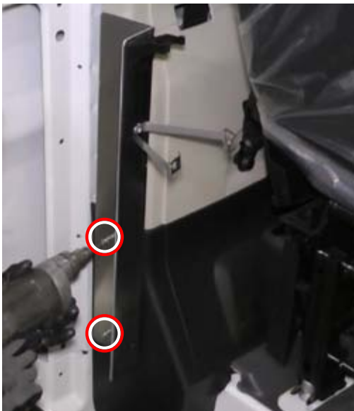
Fire extinguisher bracket fasteners