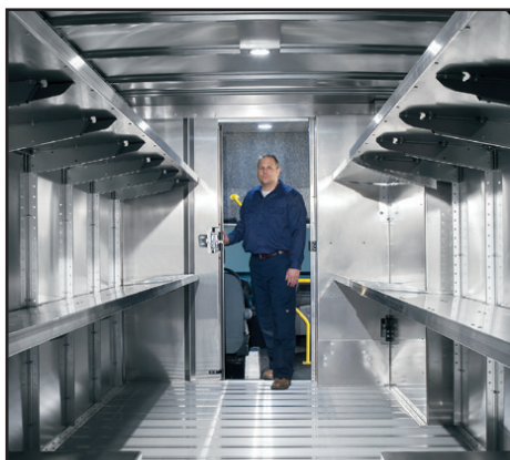
Heavy duty shelving and sliding bulkhead door with Kason latch