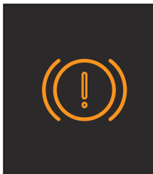
Improved safety low step heights