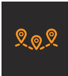
Designed for multi-stop deliveries