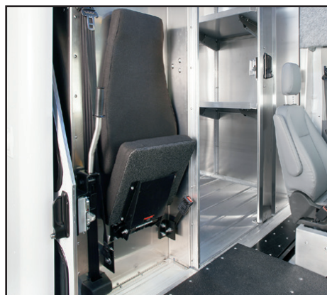
Optional jump-seat, level cab to cargo area transition with non-slip grit surface