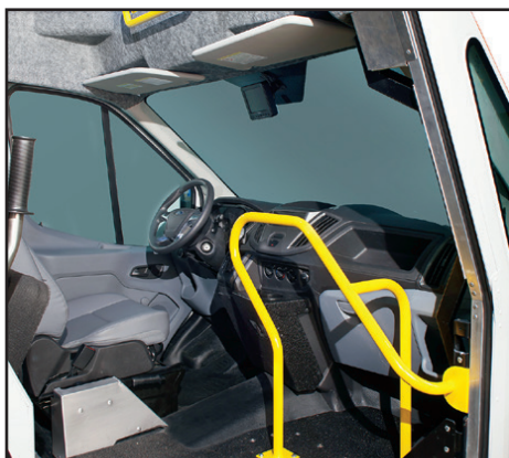
42" wide sliding door opens to spacious cab area with Three Points of Contact grab bars