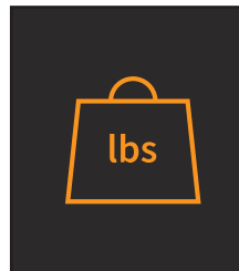
Available in Class 2 & Class 3 GVWR