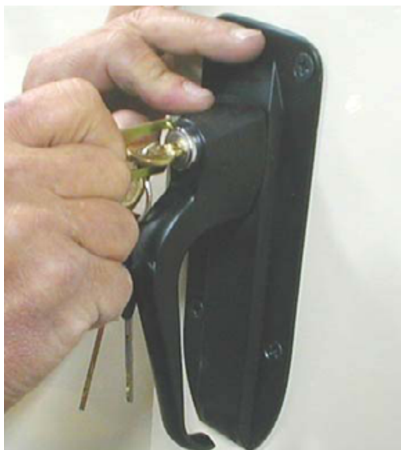
Remove and reuse the existing lockset